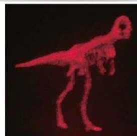
Fig. 1: Circuit board exclusively developed for holography calculation (above) and example of playback using the exclusive system (one shot of a moving dinosaur) (below)