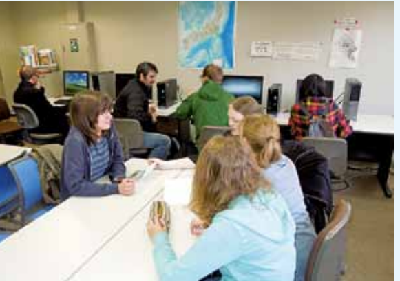
Japanese Language Study Room