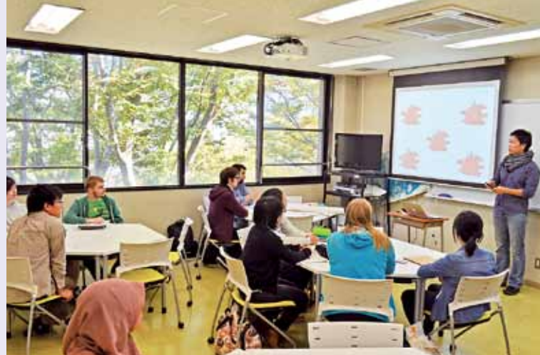
Class in English with Japanese students