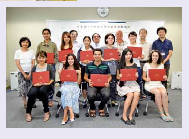
Nikkensei closing ceremony