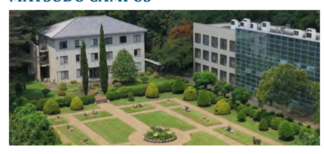
This campus is home to the following fields: Horticulture