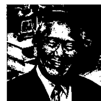
Purdue University Distinguished Professor Mr. Ei-ichi Negishi (Teijin Group Distinguished Fellow) 5th year Teijin Kumura scholarship (1957)

When you find your own "Dream", please challenge it thoroughly until the truth is investigated. I look forward to your great success in the future.